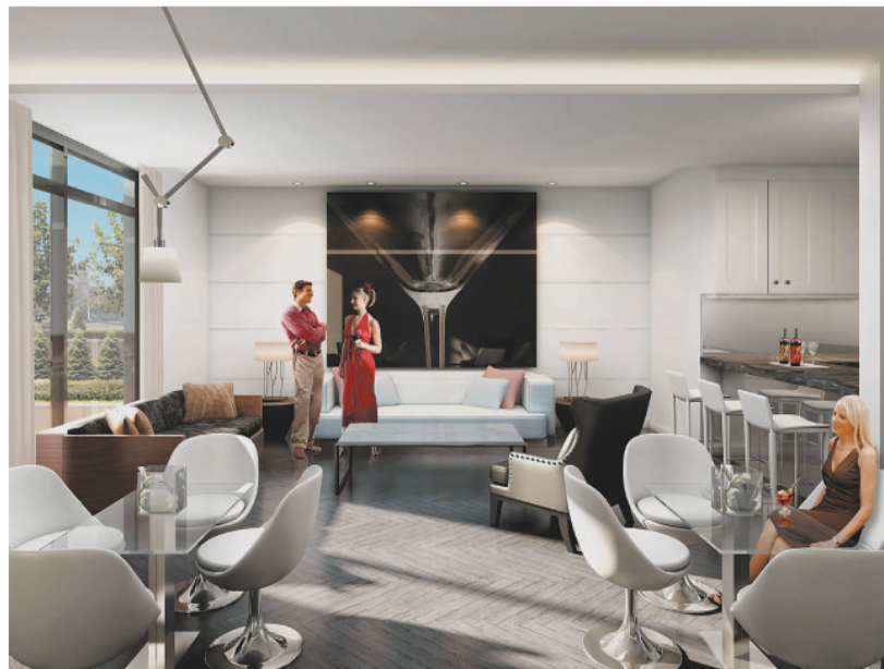
Ocean Club's pale palette doesn't distract from the lake vista.